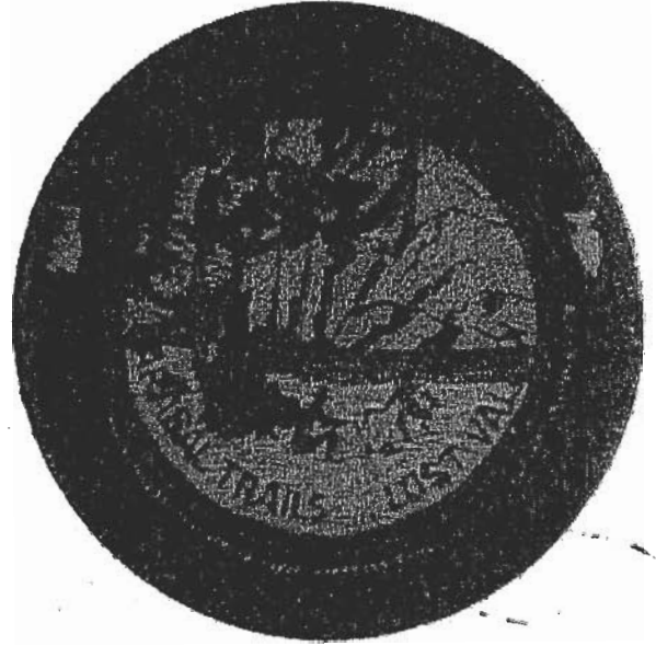
FIG. 1-7 TARABEL TRAIL 4" DIA. w/Segments