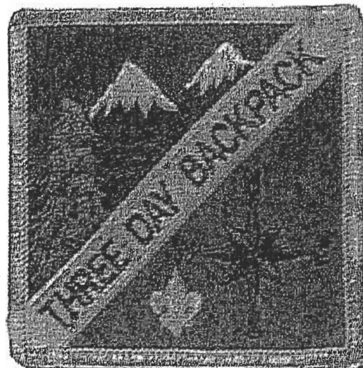
FIG. 1-4 THREE DAY BACKPACK 3" x 3"