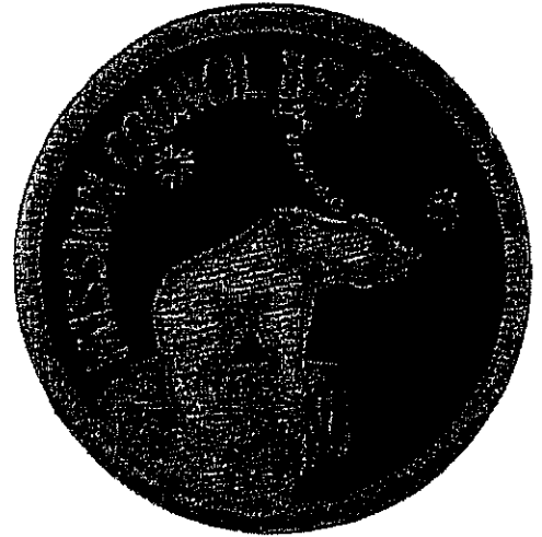
FIG. 9-5 POLAR BEAR 3" DIA.