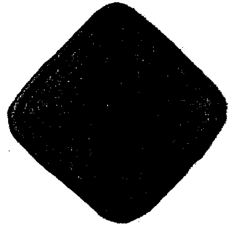
FIG.2-7 HARDBACK AWARD 2" x 2"